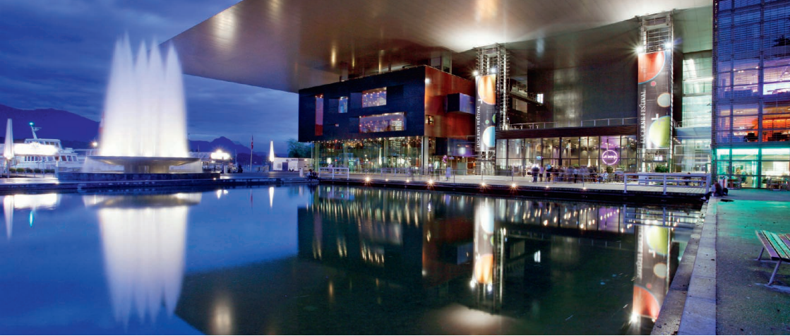
KKL Luzern (Lucerne Culture and Congress Centre)