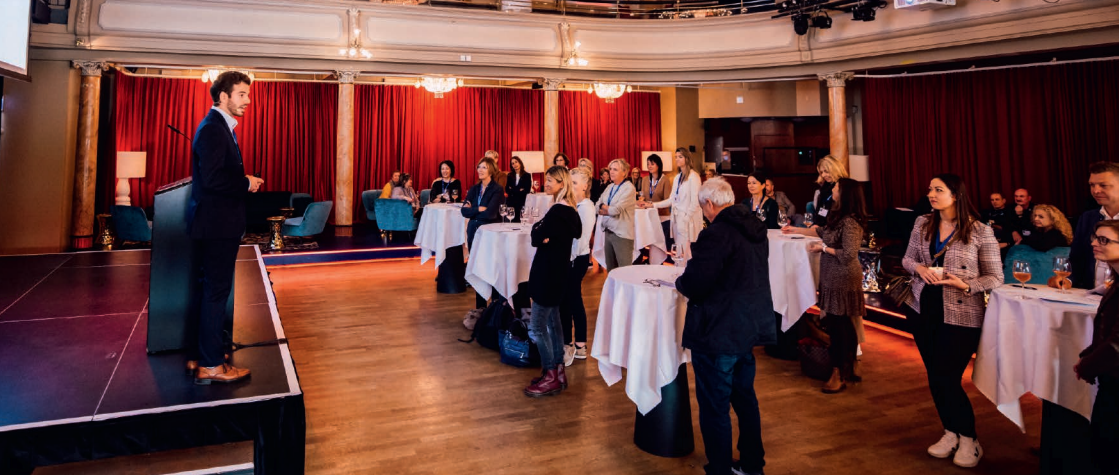
Customer event at the Grand Casino Luzern