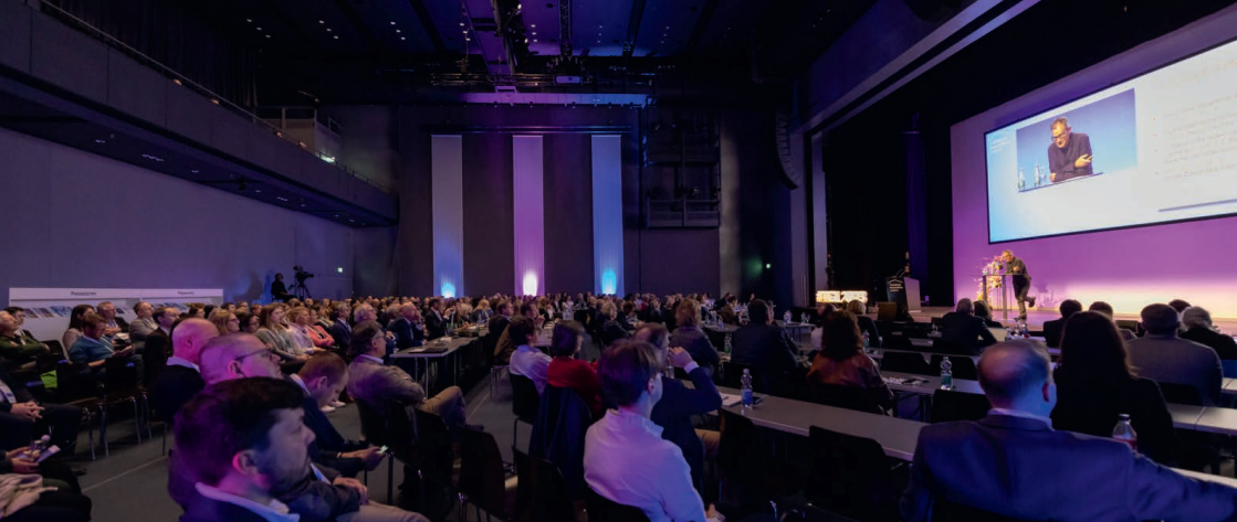
Health congress at the KKL Luzern