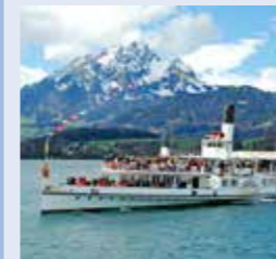
SCHILLER 1906 Capacity 900 110 banquet seats