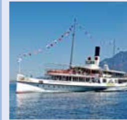
UNTERWALDEN 1902 Capacity 700 171 banquet seats