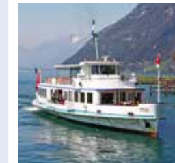
TITLIS Capacity 300 96 banquet seats