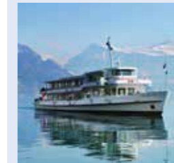
WALDSTÄTTER Capacity 700 276 banquet seats