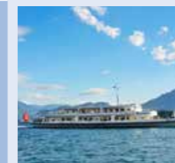
WINKELRIED Capacity 700 174 banquet seats