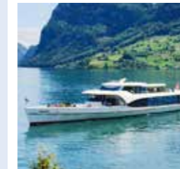
PANORAMA-YACHT SAPHIR Capacity 300 80 banquet seats