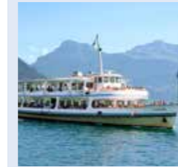
EUROPA Capacity 1000 282 banquet seats