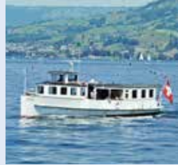
RÜTLI Capacity 140 36 seats