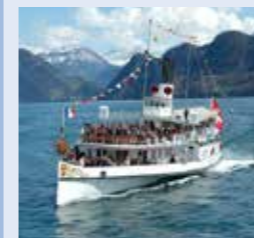
GALLIA 1913 Capacity 900 98 banquet seats