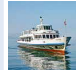
WEGGIS Capacity 500 152 banquet seats