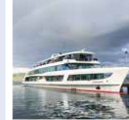
DIAMANT Capacity 1100 400 banquet seats