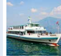
BRUNNEN Capacity 400 166 banquet seats