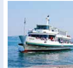
FLÜELEN Capacity 400 166 banquet seats