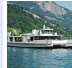
CATAMARAN CIRRUS Capacity 300 120 banquet seats