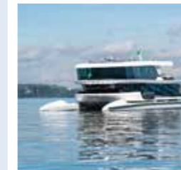
BÜRGENSTOCK SHUTTLE Capacity 300