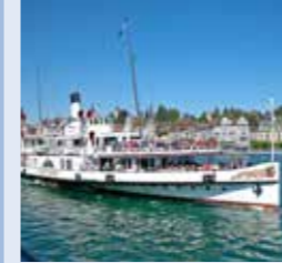
STADT LUZERN 1928 Capacity 1100 290 banquet seats