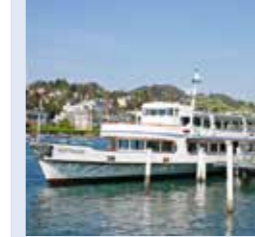
GOTTHARD Capacity 700 290 banquet seats