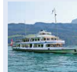
SCHWYZ Capacity 900 190 banquet seats