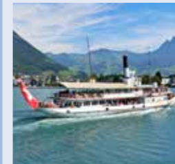
URI 1901 Capacity 800 166 banquet seats